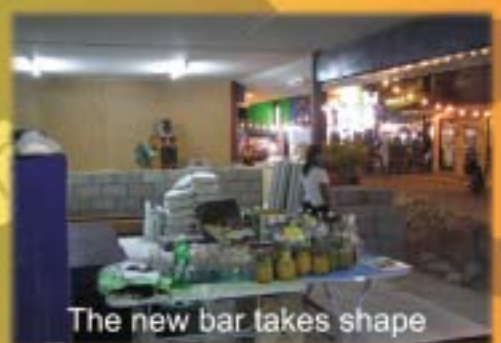
The new bar takes shape