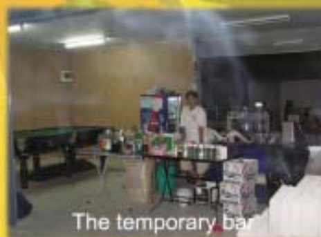
The temporary bar