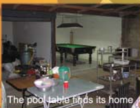
The pool table finds its home