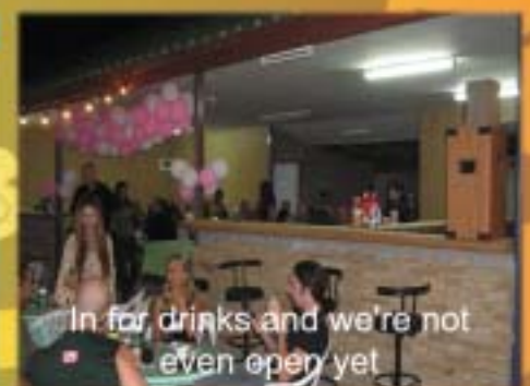
In for drinks and we're not even open yet