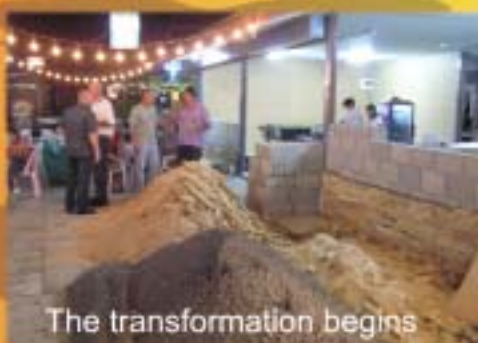
The transformation begins