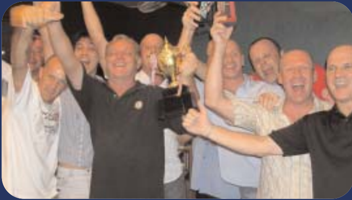
Left: The boys seemed fairly pleased with their win in the darts league