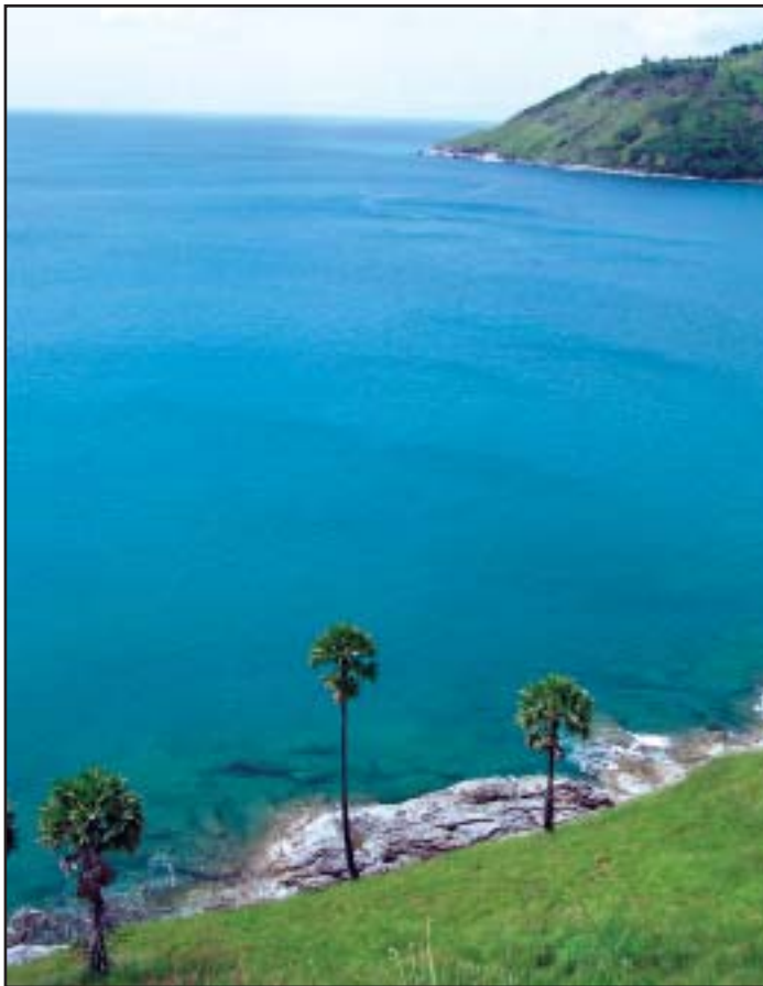
Early afternoon at Nai Ham Bay