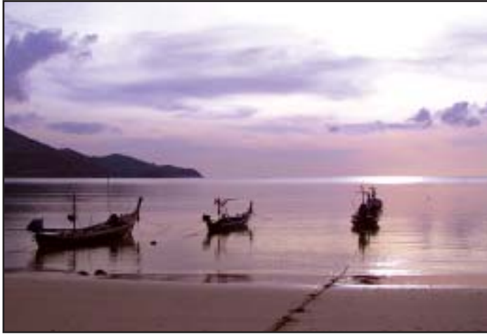
Sunset at Nai Yang